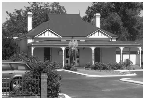
Swingler House, where land was recently subdivided and successfully developed into residential and commercial units while retaining character and charm.

When carrying out development works to their property, owners should be mindful that the new materials are compatible with the existing materials and that special features of the building are respected. New work is generally permissible if it is complementary, reversible and respectful of the