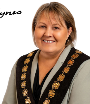
Teresa Lynes Mayor