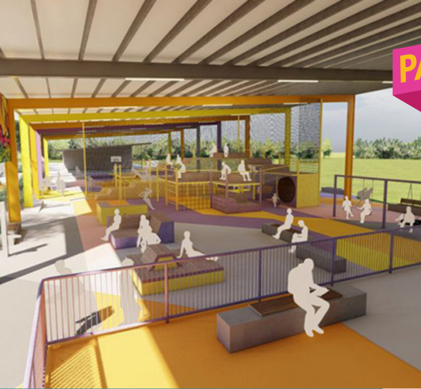
Youth Entertainment Space at Sutherlands Park, Huntingdale